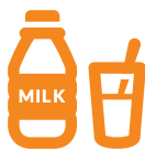
milk and dairy products