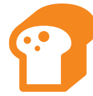
baking and confectionery products