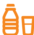
mineral water and non-alcoholic drinks