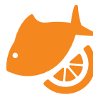
fishery and fish products