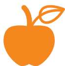
fresh and processed fruit and vegetables