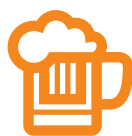
brewery and malt products