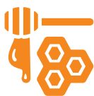
ecological, dietary and healthy foods