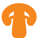
fungi and related products