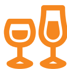
spirits and yeast industry products