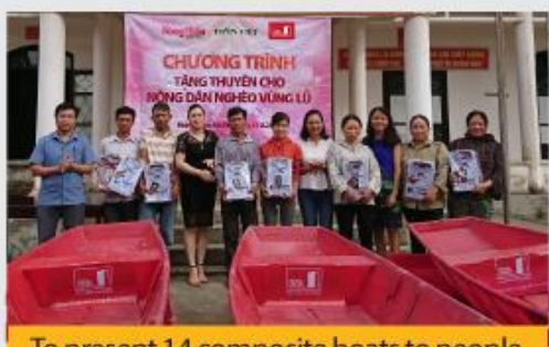
To present 14 composite boats to people in flood prone areas in Ha Tinh province