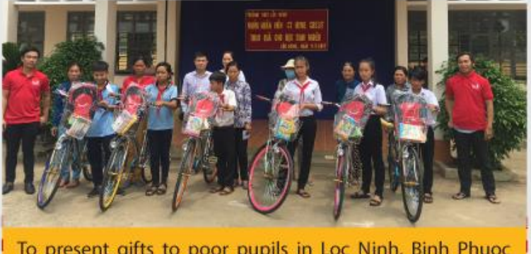
To present gifts to poor pupils in Loc Ninh, Binh Phuoc province